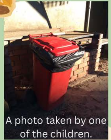
A photo taken by one of the children.

During the last month the children have had the opportunity to participate in the vacation care program. We were able to relax and have movie days, a photography day and a cooking day where we made Chocolate coconut balls and Sausage rolls.